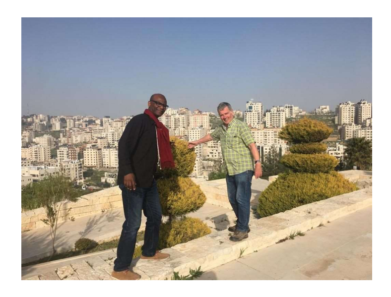
Photo: Members of our group visiting the garden at the Mahmoud Darwish museum overlooking Ramallah.