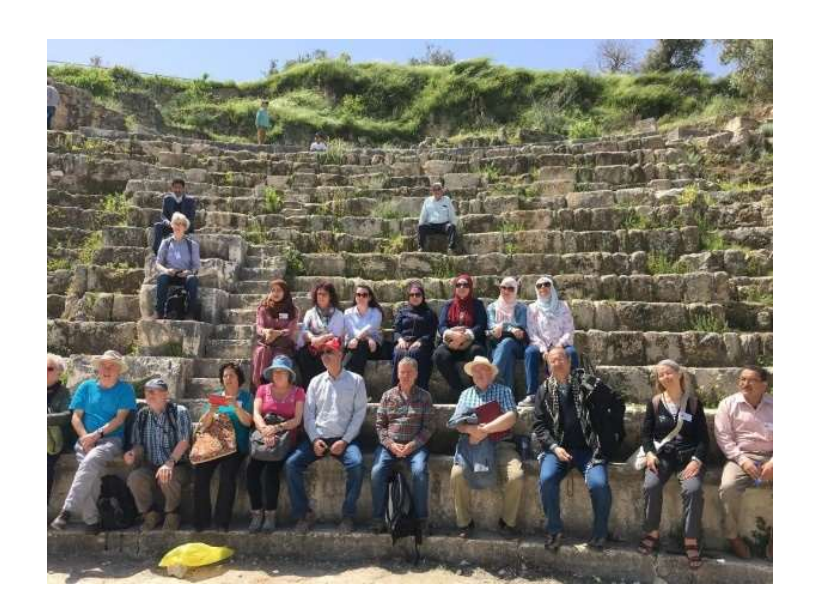
Photo: A group of participants from the conference in the Roman Amphitheatre

13th April On the second day of the Conference we went to Sebastya, which is about 10 miles outside Nablus and is linked with Hanwell in London. We were shown the Roman remains; the Roman elite used to come here from Nablus. We saw columns, a small theatre, an amphitheatre, and also the remains of a 6th century BCE Greek tower.