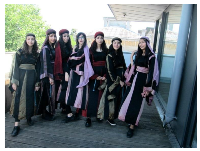
REPORT - DABKE YOUTH VISIT FROM RAMALLAH 27<sup>th</sup> June to 8<sup>th</sup> July 2018

This successful visit, relied on the energy of our visitors and the support and enthusiasm of so many local organisations and individuals. We are very grateful to the following organisations for their financial and/or general support: Palestine Unlocked, Unite the Union Cowley Plant Branch and South East Region, Oxford City Council Cultural Fund, Arura Faringdon Friendship Association, Oxford University Museum Service and many other groups and individuals.