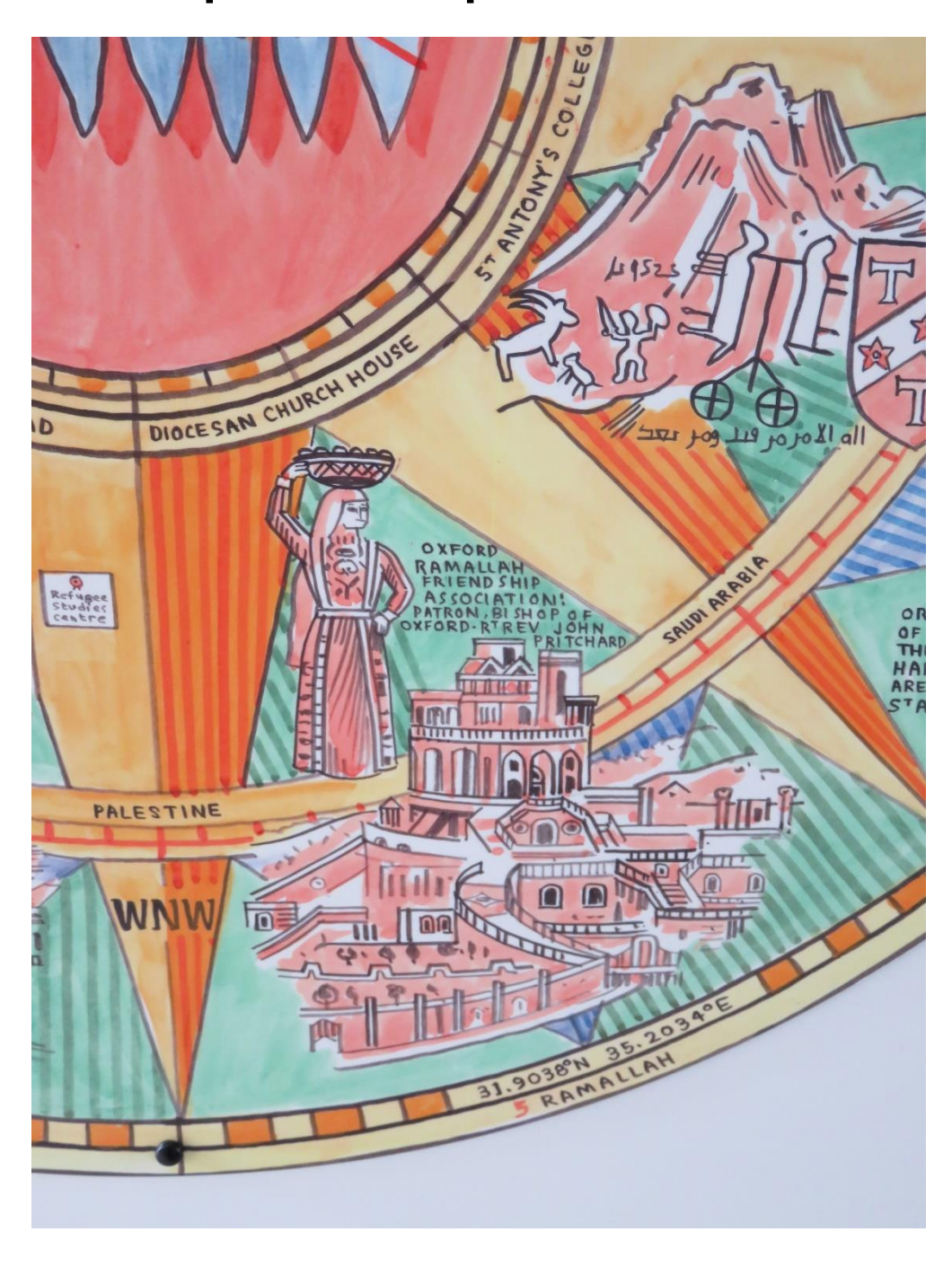
ORFA AGM Tuesday 21st May 2019 6pm Town Hall St Aldates Oxford